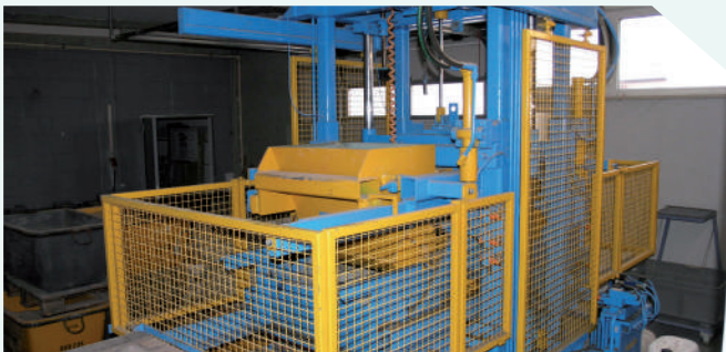
Figure 1: Labscale briquetting/pavestone device

ISTRA CAC binders are traditionally used in applications such as building chemistry, sewage pipes, refractory mortars and refractory linings. In addition, ISTRA CAC binders can also be used in special applications in the treatment of liquid and solid wastes. For solid wastes, ISTRA CAC binders can be used to consolidate materials in processes where ordinary Portland cement (OPC) is ineffective. In waste water processing, ISTRA CAC binders are used because of the binding effect of the soluble calcium aluminate ions with the undesired constituents.