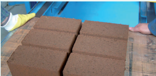
Figure 2: Briquettes made of ISTRA CAC and waste material