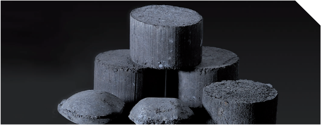
Figure 3 shows the compressive strength of ISTRACAC and OPC with the same waste material. The briquette made with the ISTRACAC binder can readily be reintroduced into the process after one day. This is because of the rapid hardening characteristics of our ISTRACAC binders. However, because of the

different hydration mechanism of OPC, the briquette that was made with OPC does not meet the minimum compressive strength requirement of 5 N/mm 2 . It does not have the necessary mechanical strength to allow for reintroduction into the process.